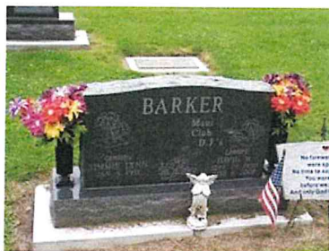
Added by RWCNAC